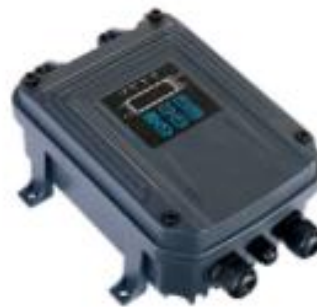
Digitized MPPT Controller