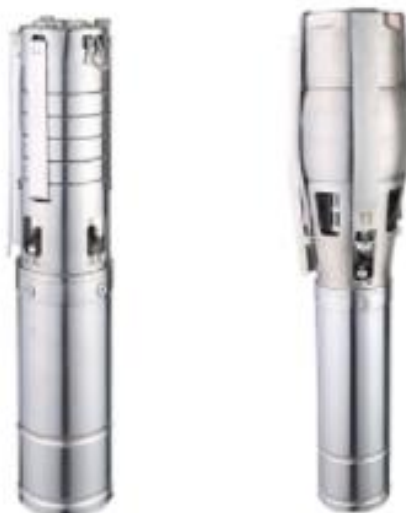
4 Inch Centrifugal Pump With Stainless steel Impeller