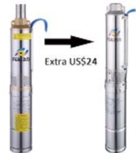
3 Inch Centrifugal Pump With Stainless steel Impeller